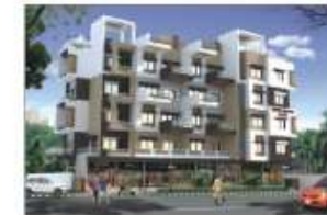
SHUBH SWAPN ENCLAVE Plot No. 5.6, zulelei society, 24 Mtr. DP Road, New Manish Nagar, Somawada, Nagpur