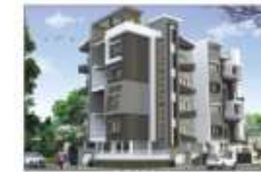
PRIDE RESIDENCY-I Plot No. 173, Jai Durga Society-2, Manish Nagar, Somawada, Nagpur