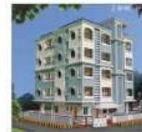
NIRMAN MANOR Dwerkapuri, Near Dmkar Nagar Sq, Ring Road, Nagpur