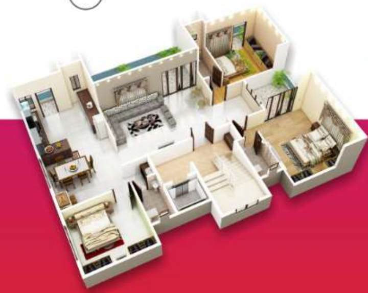
ISO METRIC VIEW