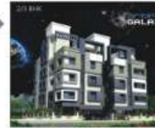
NIRMAN GALAXY Plot No. 35.36, Pancharam Housing Society, Somawada, Nagpur