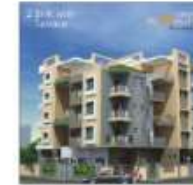
NIRMAN PLEASURE Bhole Nagar, Ring Road, Nagpur