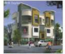
NIRMAN ORCHID Plot No. 56A, Kharbi Sq, Dighori Road, Nagpur