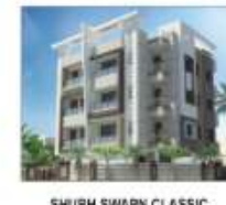
SHUBH SWAPN CLASSIC 39, Suraj Guhanitman Society, Manish Nagar, Nagpur