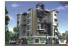
PARK RESIDENCY Plot No. 197, 198, Jai Durga-2 Society, Manish Nagar, Somawada, Nagpur