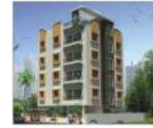
NIRMAN ORCHID Plot No. 54A, 55A, Kharbi Sq, Dighori Road, Nagpur