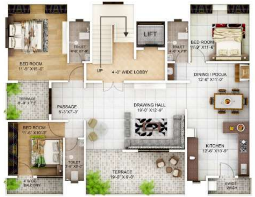
2nd & 4th Typicle Floor (3 BHKD Flat)