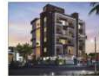
GLOBAL RESIDENCY Ploy No. 61.62 Amar Nagar Guhanitman Sahakar Sanstha, Manish Nagar, Nagpur