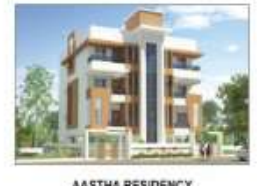
AASTHA RESIDENCY Plot No. 33, New Om Nagar, Rotkar Layout, Hudkeshwar (BU) Nagpur-440034