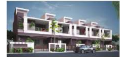
SHUBH SWAPN VILLA Plot No. 4.5, 6, 7, 8, New Om Nagar, Rotkar Layout, Hudkeshwar (BU) Nagpur-440034