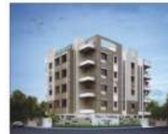
ROYAL RESIDENCY Plot No. 5, Sukhakarta Society, Hudkeshwar Road, (BU) Nagpur