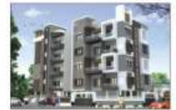
PRIDE RESIDENCY-II Plot No. 170, Jai Durga Society-2, Manish Nagar, Somawada, Nagpur