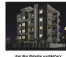
SHUBH SWAPN HARMONY 73.74, Gilaraj Society, Manish Nagar, Nagpur