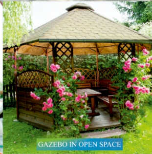
GAZEBO IN OPEN SPACE