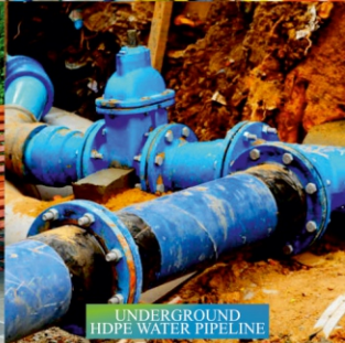
UNDERGROUND HDPE WATER PIPELINE