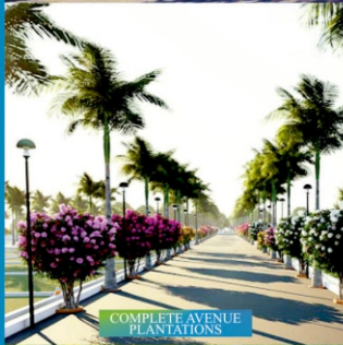
COMPLETE AVENUE PLANTATIONS