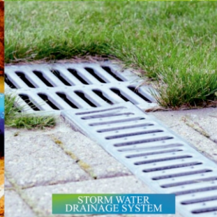
STORM WATER DRAINAGE SYSTEM